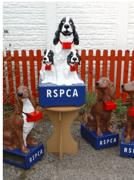
Some of our boxes with the Snowdon Mt Railway dogs in the centre