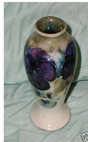
The Moorcroft vase